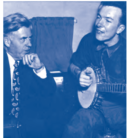
Henry A. Wallace and Pete Seeger

Our vast and beautiful land is peopled with diverse, innovative citizens with inherent vitality and good will. But we need a greater awareness of the responsibilities that go with great freedom. This visual presentation includes a broad view of turning points in American history and the nation's many heroic individuals as they shine with inspiring light while facing the nation's powerful darkness.