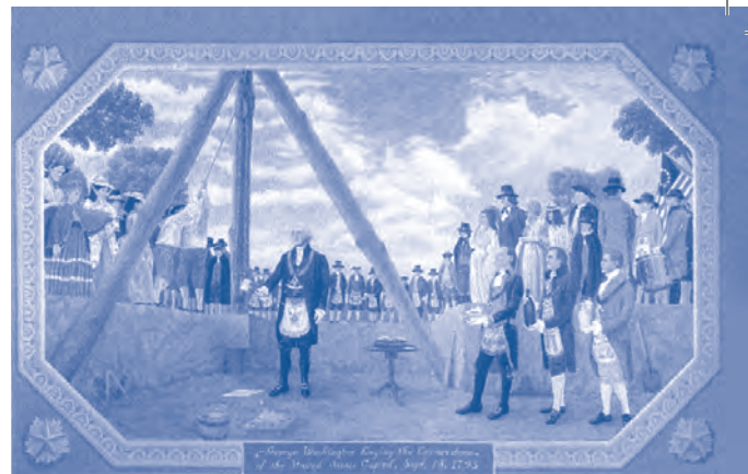
George Washington Brick Laying Ceremony

Most people are familiar with the well-known names of the American Renaissance: Dickinson, Emerson, Hawthorne, Poe, and Thoreau, for instance. But few are aware of just how much these authors' works were infused by esoteric currents and practices. Alchemy, folklore, and Platonism all intermingled to create what we now know as the American Renaissance, but which really represents the first literary, philosophical, and religious flowering of the United States. Could such a time come again?