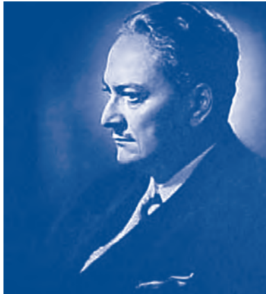
Manly Palmer Hall

In Inner Revolution , Robert Thurman argues that America, in its soul, ideals, and dreams (now being resuscitated by President Obama), beautifully interweaves with the socially revolutionary movement that arose in Shakyamuni Buddha's enlightenment and came down to us through history in the enlightenments of millions of Buddhists. In this talk, he expands on how the pursuit of real happiness could manifest in America in this century.