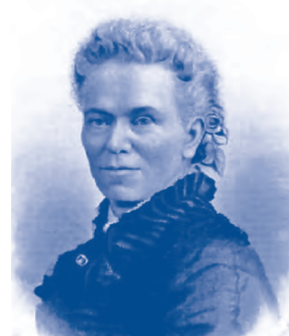
Matilda Joslyn Gage

What was in the water that made Upstate New York the hotbed of social justice and religious ferment in the country during the first half of the 19th century? A look at the childhood, religious background, and lifework of the triumvirate that led the radical wing of the woman's movement may provide some insights. Elizabeth Cady Stanton, Susan B. Anthony, and the most visionary of all, the forgotten feminist Matilda Joslyn Gage who was deeply influenced by the Iroquois peoples, speak to us from the past.