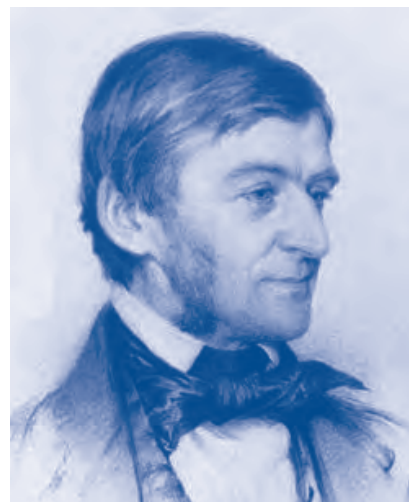
Ralph Waldo Emerson

Several prominent Founding Fathers were Freemasons and the legend of a Masonic influence in America's origins is a popular belief. But how true is the legend? What role did Masonry really play in the American Revolution and how did Masonry impact the new republic as the 19th century progressed? Is there an esoteric core to "the Craft," as some allege? This talk will pay particular attention to the Freemasonic experience in America, where a unique set of circumstances have produced a most paradoxical result: a secret society for the common man.