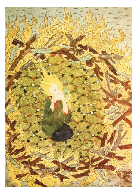
Abraham surrounded by flames, detail from manuscript Anthology of Iskandar, Iran, 1410

We will explore the multiple inner connections between the three religions of the One God and ask how these could manifest in relatively peaceful coexistence in Al-Andalus. We will examine ways in which the three Revelations mysteriously seem to be each within the other, in endless conversation, forever echoing and referring to each other like magic, multidimensional Chinese Boxes. Against the still fluid background of their evolving theologies and practices, we will see what we can learn today of the virtues of the heart that unite them: love of God, neighbor, stranger and the Earth, and all that follows from these.