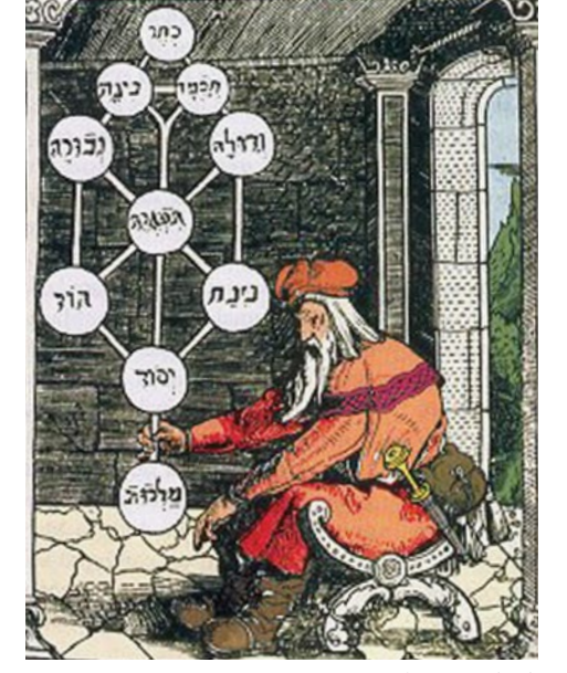
The Tree of Life

This talk takes us imaginatively into the alchemical drama of creation, where we can begin to explore the transformational journey of the mind and heart that is initiated by the alchemical process. By working creatively with the timeless symbols arising from the archetypal world of the psyche, we can discover the insights and special spiritual gifts that the alchemical quest still offers to the contemporary world.